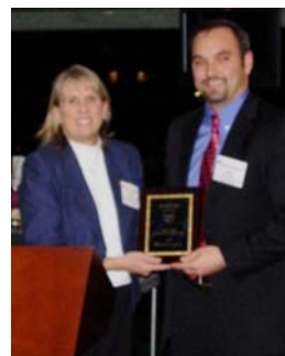
Friend of the Year, First Class Lawn & Landscape