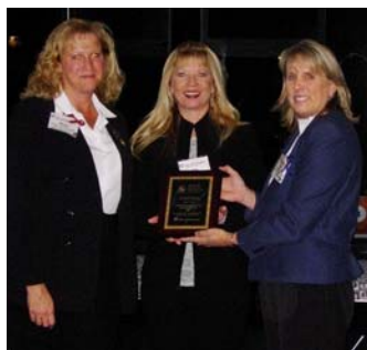
AMO of the Year, Pedcor Companies