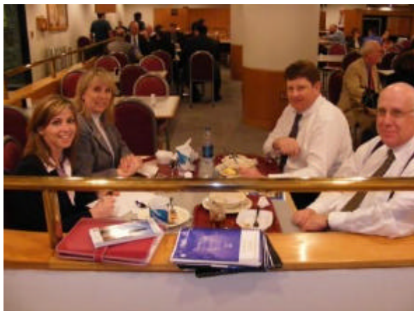
A few of the high power lobbyist having a bowl of Senate Bean Soup in the Senate Cafeteria for lunch.

This year was the fifth time that CCIM Institute members joined IREM for the Hill Visit. Members voiced our industry's concerns on Banks in Real Estate, Tax Reform and Leasehold Improvements, Property/ Casualty/ Terrorism Insurance, and Climate Change and Energy Efficiency in over 200 separate meetings with U.S. Senators and Representatives. To view the briefing papers on the issues, click here . We met either with the elected representative or a member of their staff responsible for the issues we were discussing. This year we were able to see what seniority can do for a member of congress. We met with Representative Dan Burton in his new office and saw his room with a view.